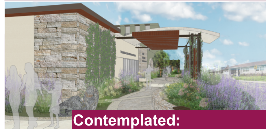
Contemplated: UCSF Health | Sonoma Valley Outpatient Center